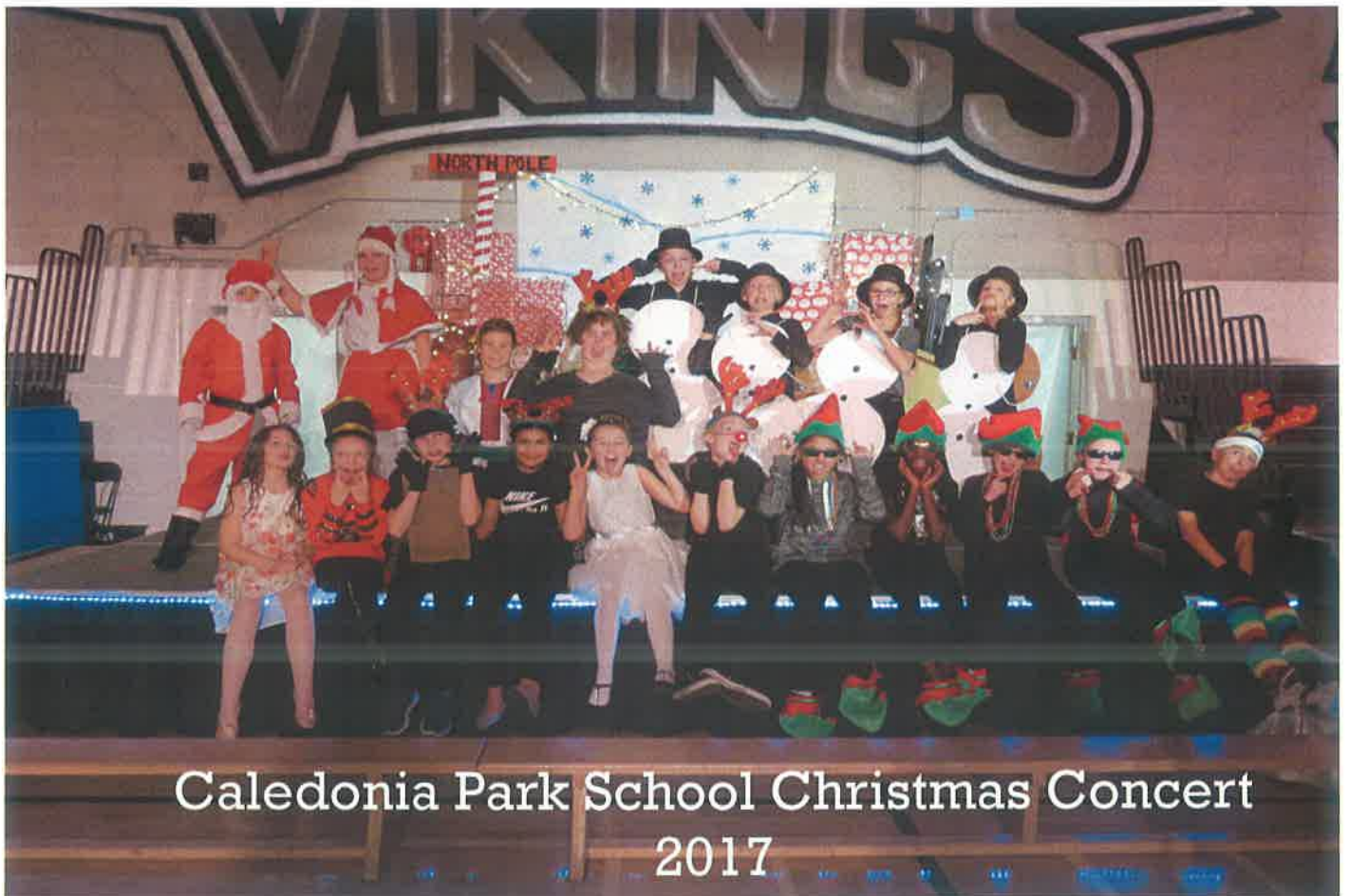
Caledonia Park School Christmas Concert 2017